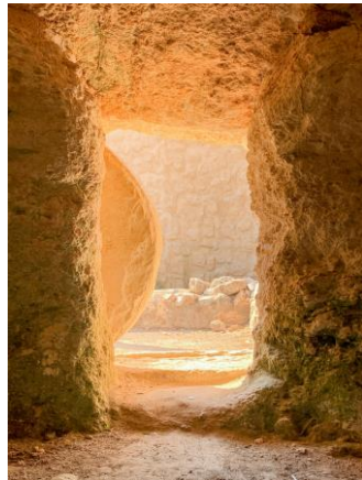
He is Risen!